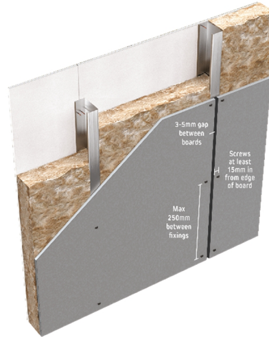
Diagram 2 - typical detail of fixing layout